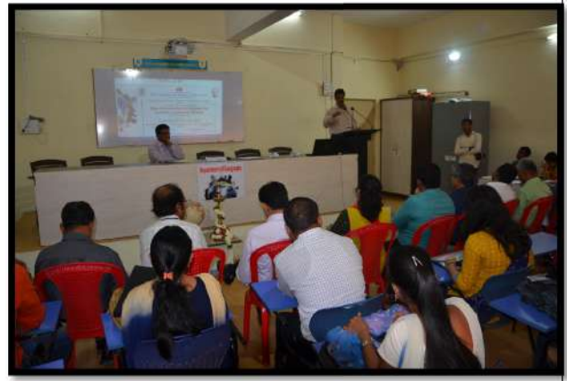
Technical Session- VI