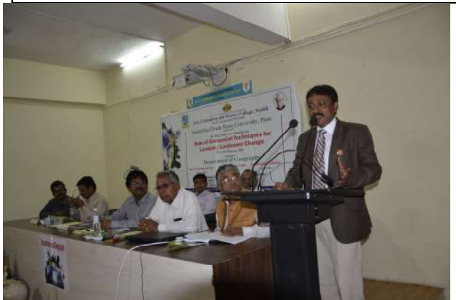
Technical Session- V