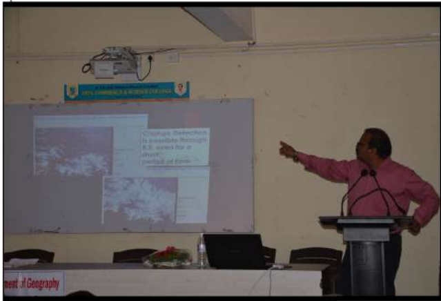
Technical Session- IV