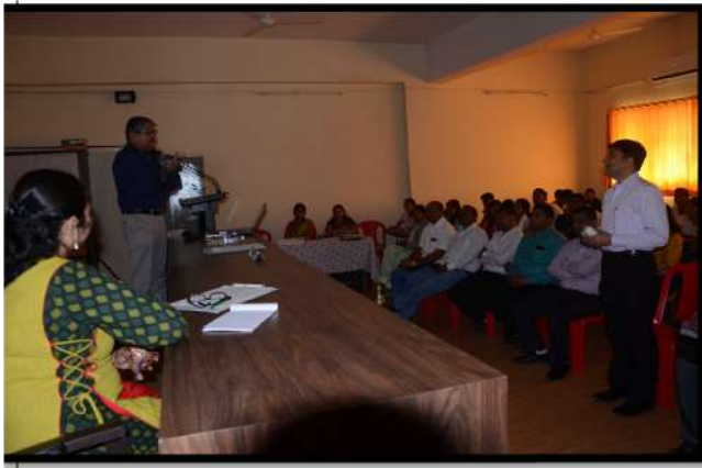
Technical Session- III