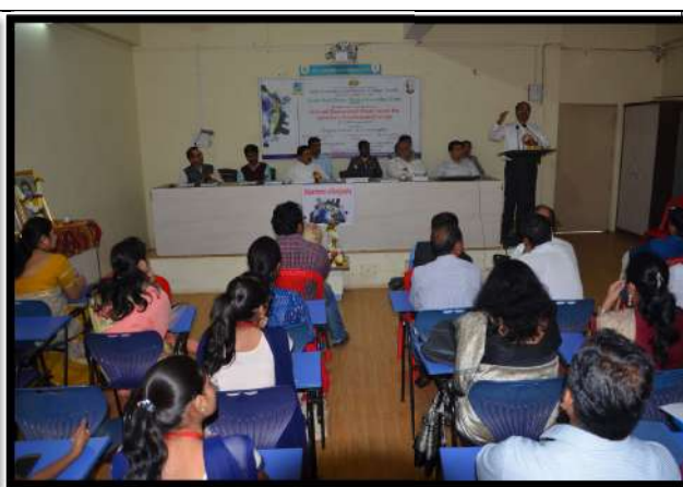
Key note Address