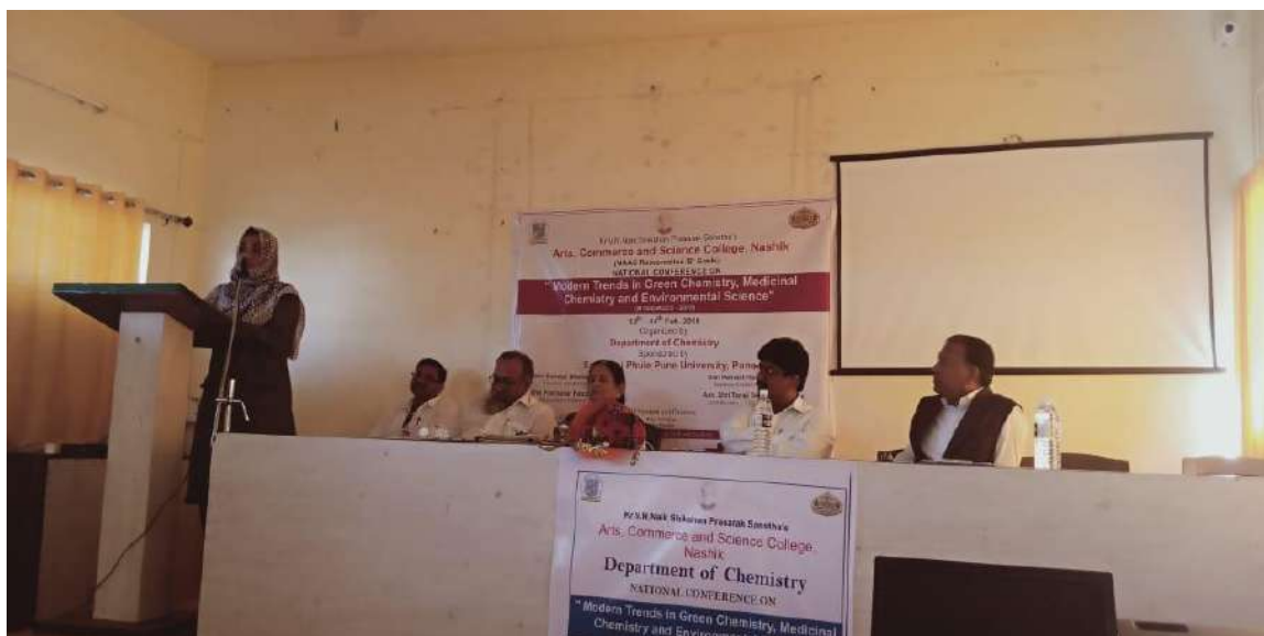
Participant expressing her opinion about the conference in the valedictory Function