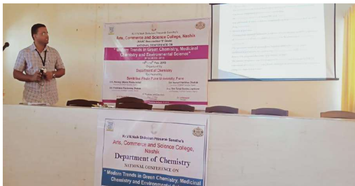
Participant presenting an oral presentation in the session